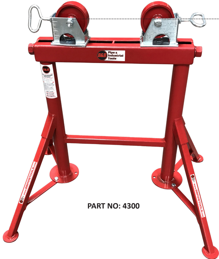
PART NO: 4300