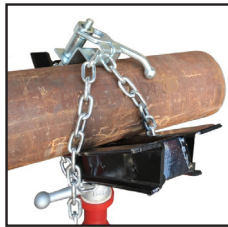
PN 3506 Hold Down Chain Locks Pipe to Jack