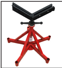
PN 3500 5 Leg Giant Jack (no wheels, no casters) 28" L x 28" W x 24" H 24" - 38" Operating Height