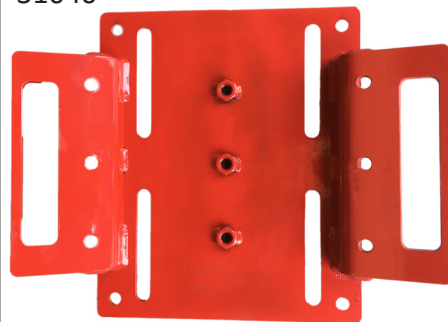
Body of Clamp