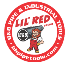
PN 2003 - Pipe Sling