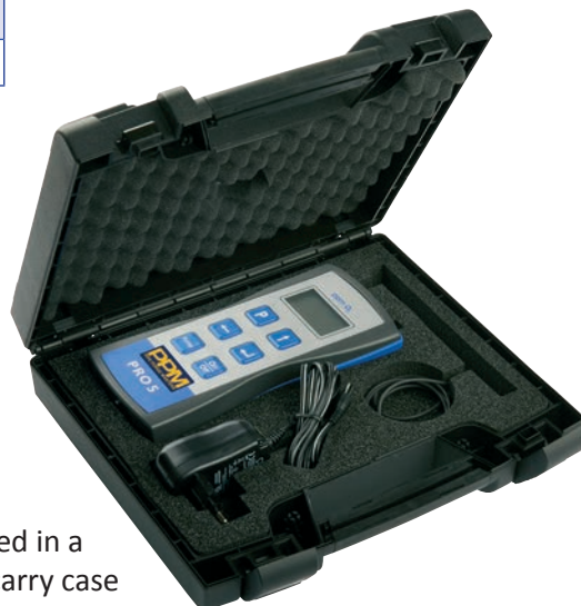
Supplied in a durable carry case