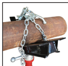
PN 3506 Hold Down Chain Locks Pipe to Jack